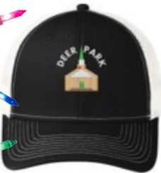
Port Authority Snapback Trucker Cap $21.99