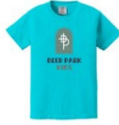
Comfort Colors Youth Heavyweight Ring Spun Tee $17.99