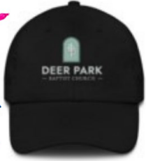
Classic Dad Hat $22.99

Check Out: thechurch.shop/shop/deer-park/