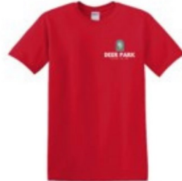
Gildan Heavy Cotton T-Shirt From $13.99