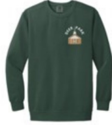
Comfort Colors Lightweight Fleece Crewneck Sweatshirt From $37.99