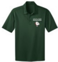
Deer Park - Port Authority Silk Touch Performance Polo From $28.99