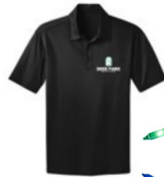
Port Authority Silk Touch Performance Polo From $28.99