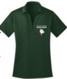
Deer Park - Ladies Port Authority Silk Touch Performance Polo From $28.99