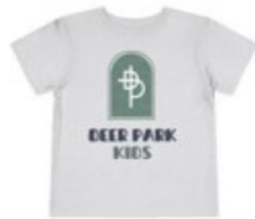
Toddler Jersey Tee $14.99