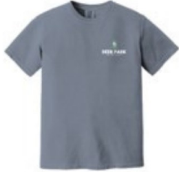
Comfort Colors Heavyweight Tee From $24.77