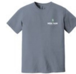
Comfort Colors Heavyweight Tee From $24.77