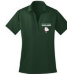
Deer Park - Ladies Port Authority Silk Touch Performance Polo From $28.99