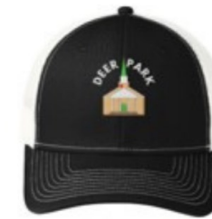
Port Authority Snapback Trucker Cap $21.99