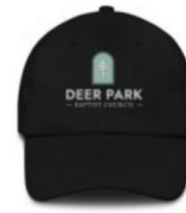
Classic Dad Hat $22.99

Check Out: thechurch.shop/shop/deer-park/