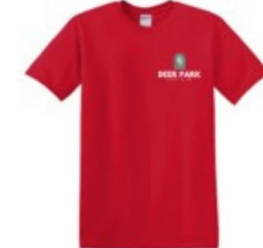
Gildan Heavy Cotton T-Shirt From $13.99