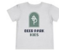
Toddler Jersey Tee $14.99