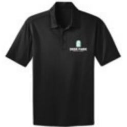
Port Authority Silk Touch Performance Polo From $28.99