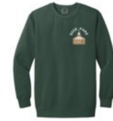
Comfort Colors Lightweight Fleece Crewneck Sweatshirt From $37.99