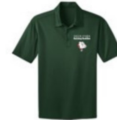
Deer Park - Port Authority Silk Touch Performance Polo From $28.99