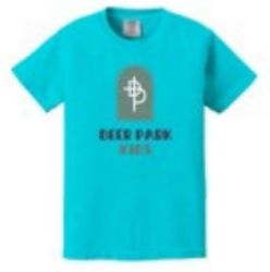
Comfort Colors Youth Heavyweight Ring Spun Tee $17.99